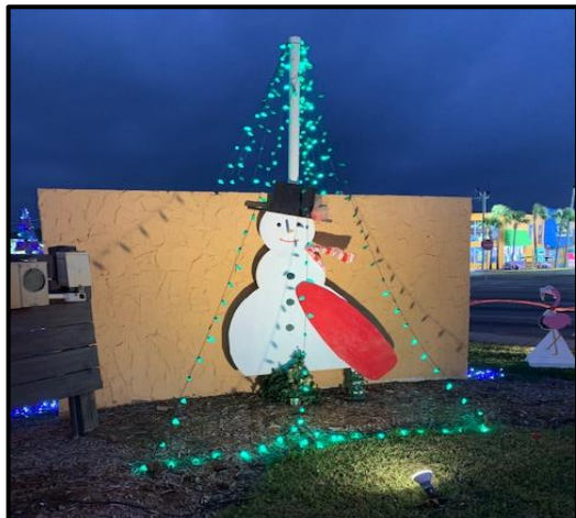
Frosty the Snowman Backs Up (literally) the Welcome Triangle Sign