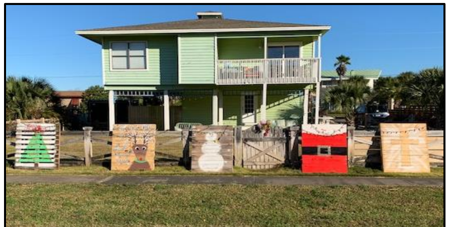
A Pallet-Hinge of Christmas Art Work Along Santa Rosa Blvd