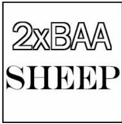
Wuzzle No. 1