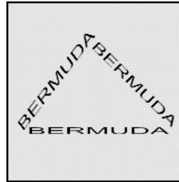
Wuzzle No. 3