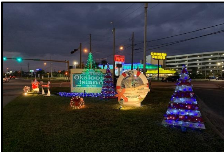
The Welcome Triangle – OILA Christmas 2019