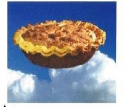
There'll be Pie in the Sky By and by when I die And it'll be alright, it'll be alright