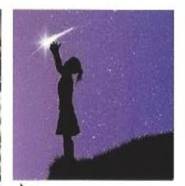
When you Wish Upon a Star Makes no difference who you are Anything your heart desires will come to you