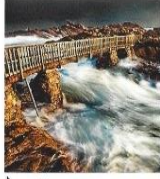
J Like a Bridge Over Troubled Waters I will lay me down J