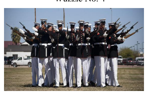
Safety in Numbers