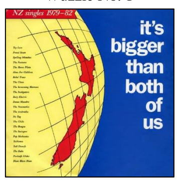
It's Bigger Than Both of Us