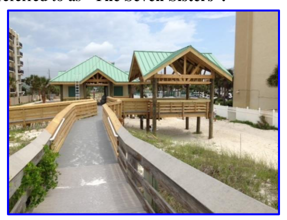
BEACH ACCESS NO. 5

The improvements to Okaloosa Island Beach Accesses No. 4, 5 and 6 are moving along. Below are photos of Beach Access No. 5 taken on June 2. Trivia fact: At one time the 7 public beach accesses on Okaloosa Island were referred to as "The Seven Sisters".