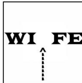
Wuzzle No. 3