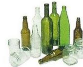
Glass Bottles & Containers