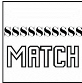
Wuzzle No. 2