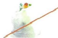
NO Plastic Bags or Bagged Recycling