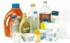
Plastic Bottles and Containers