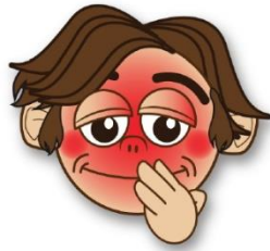
RED IN THE FACE