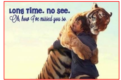
LONG TIME. NO SEE

Enjoy the beauty of Maclay Gardens State Park with the Okaloosa Island Garden Club and friends