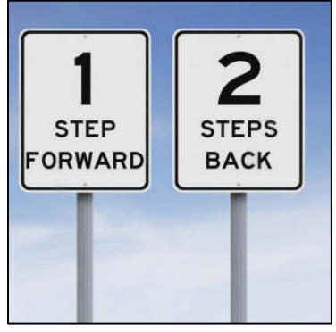
One Step Forward; Two Steps Back