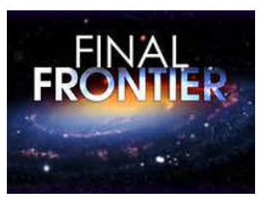
The Final Frontier