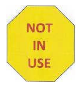
Not in Use