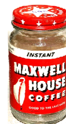
GOOD UNTIL THE LAST DROP