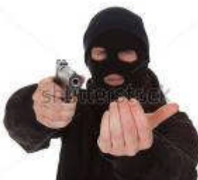
HAND IT OVER! NOW!