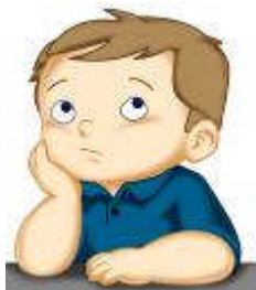
“LITTLE” DID I KNOW