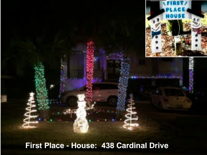
First Place - House: 438 Cardinal Drive