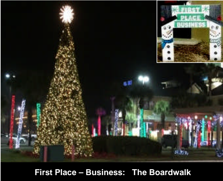
First Place – Business: The Boardwalk