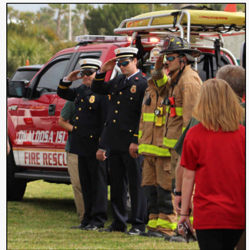
Okaloosa Island Fire Fighters Saluting the Flag as It Passes in Review