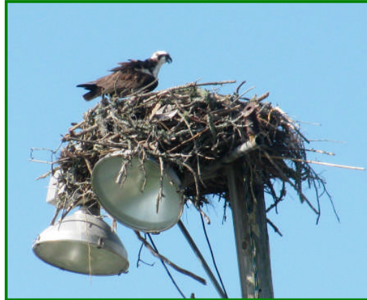
A Raptor Sits Up House on a Light Pole at the Entrance to Veteran's Park